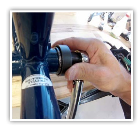
6. Use Park Tool BBT-69 to thread non-drive side cup into frame until flush. Using torque wrench, fully tighten to 35-50Nm.