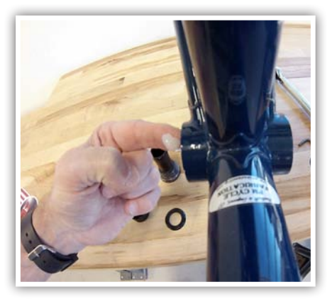
1. Thoroughly clean the bottom bracket shell. Apply a thin layer of grease to inner shell.

IMPORTANT: Thoroughly clean the bottom bracket shell and apply a layer of high quality grease to mating surfaces before installation. DO NOT use any brand bearing retaining compounds or epoxies during installation, use of which will void any warranty.