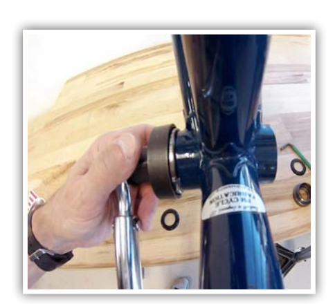
4. Use Park Tool BBT-69 to thread drive side cup into frame until flush. Using torque wrench, fully tighten to 35-50Nm.