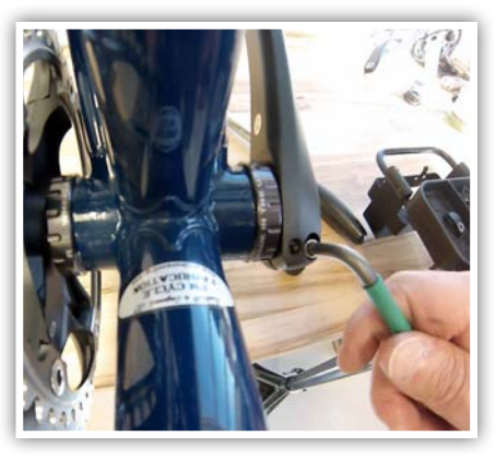
9. Install left crank arm, tighten crank to manufacturer specifications.