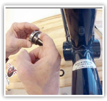
2. Apply a thin layer of grease to cup.