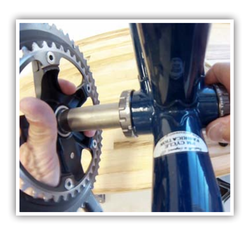
7. Install right crank arm, making sure outer dust seal is installed.