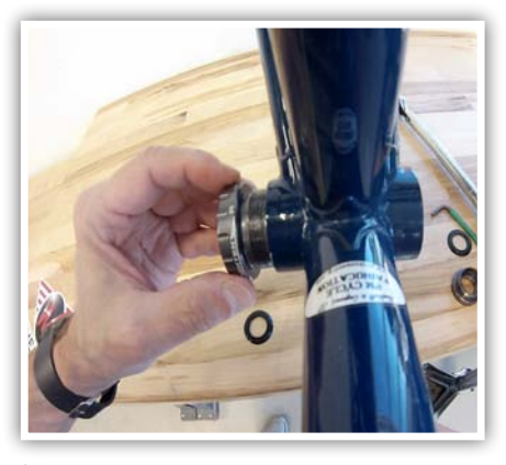
3. Insert drive side cup and center sleeve into frame.