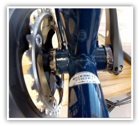
Add spacers as necessary to take up any play, remove spacers as necessary if binding occurs.

NOTE: Due to the wide variety of frame manufacturers, Wheels Manufacturing cannot guarantee compatibility with all frames. Please consult with your specific frame manufacturer before installation. Wheels Manufacturing is not responsible for damage done to your frame as a result of installation or use of this product.