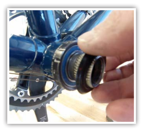
8. Make sure outer dust seal is in place before installing left crank arm.